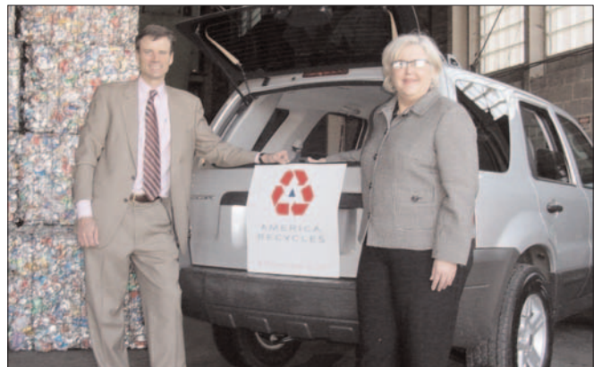
The Grand Prize – a 2006 Ford Escape Hybrid SUV— served as the container for the more than 110,000 pledge cards from which the winner was drawn. Individuals across the country pledged to increase their recycling and buying recycled products.

Thank you everyone for your help in making six people very happy recyclers!